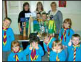
Delighted trophy winners, the Woldingham Beaver Colony.